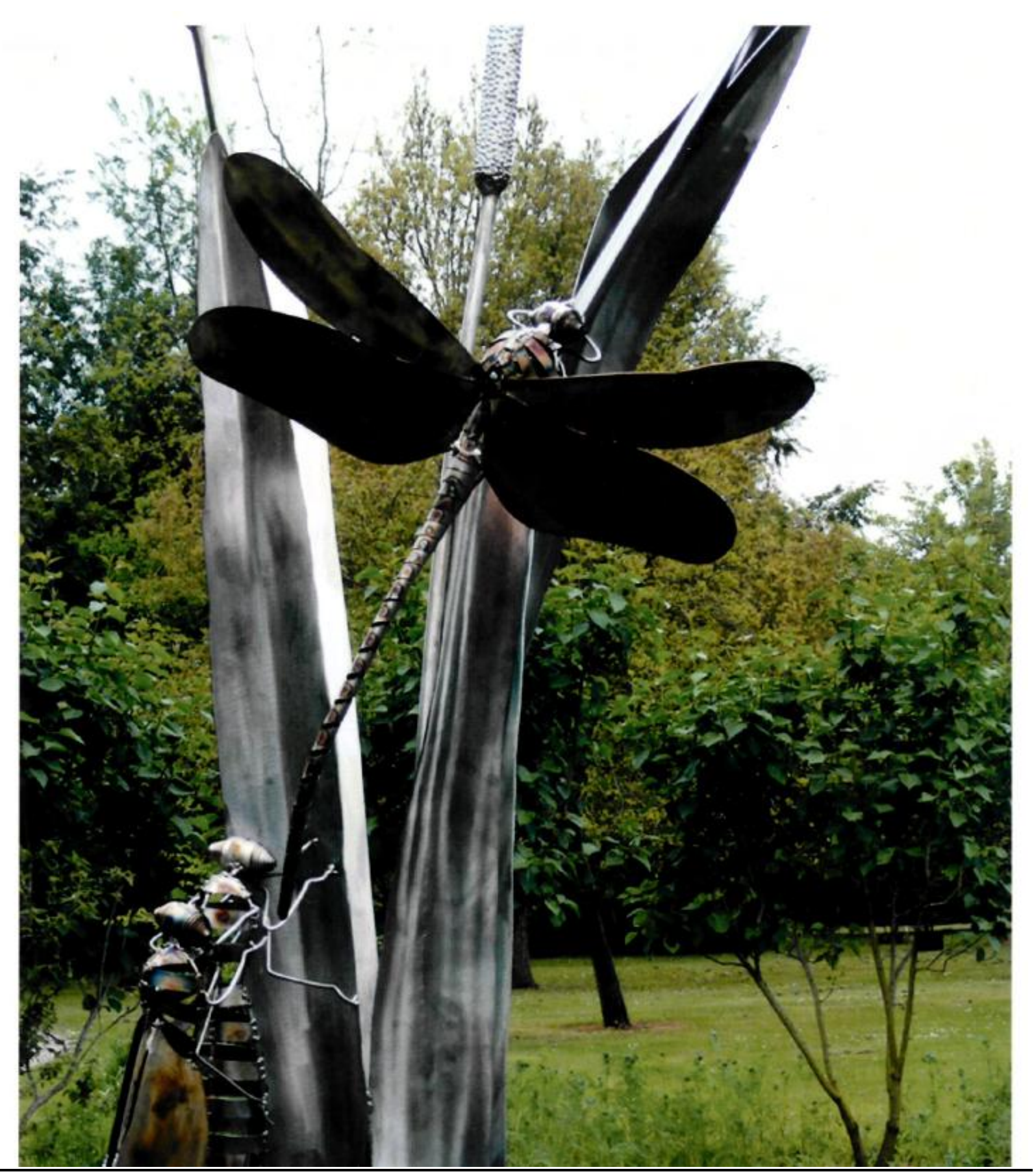
"The City of Red Bluff is an equal opportunity provider"